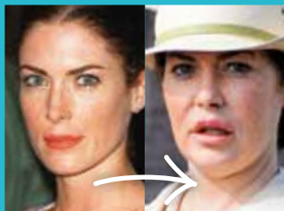
LARA FLYNN BOYLE